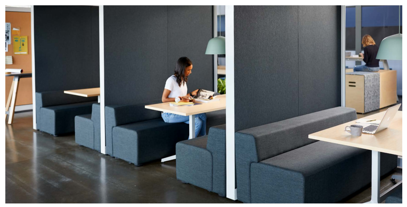
k. lounge benches pair with Rockwell Unscripted Creative Wall to create a space for individual focus work, socialization or collaboration.